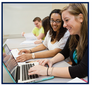
Wireless Internet access throughout 100 percent of the campus building footprint will enhance the educational experience of the campus community.

The infrastructure upgrade is a three-phase project. The first phase, upgrading the wired and wireless network in all campus residence halls, was completed this summer. Phase two will upgrade the academic and administrative network hardware and allow the completion of phase three: expanding the campus wireless network towards covering 100 percent of the campus