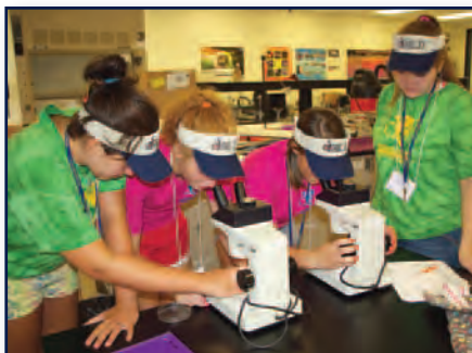
Students examine water samples from Slate Run Creek during SSME 2010.

Two local foundations are again providing funds for this year's Summer Science and Math Experience (SSME) that will allow 18 students from two area high schools to participate in the program.