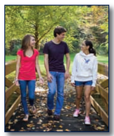
Blue & Gold Weekend is a great opportunity to enjoy autumn on the beautiful Pitt-Greensburg campus.

friends, and re-establish relationships with faculty and staff." When asked, alumni are quick to share their favorite things about Pitt-Greensburg and their memories.