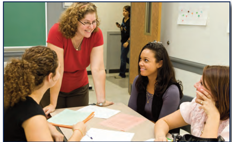
Personalized academic attention is a hallmark of the Pitt-Greensburg educational experience.

Specifically, the funding will be used to revise and update curriculum; create and implement a set of educational experiences that provide a "ladder of success" for Pitt-Greensburg students; upgrade curricular and extra-curricular programs to respond to contemporary trends in digitalization and globalization; and maintain and extend the high level of student-faculty engagement that has been the hallmark of the Pitt-Greensburg experience. The funding will support Pitt-Greensburg's endeavors to move to the next level by expanding the scope and coverage of its programs, integrating activities more effectively into a consolidated program, and