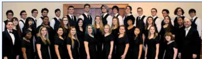
The Pitt-Greensburg Chorale & Chamber Singers