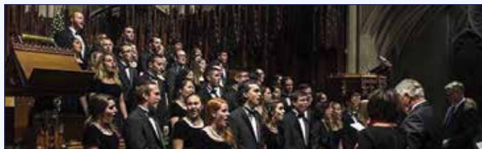
The Heinz Chapel Choir