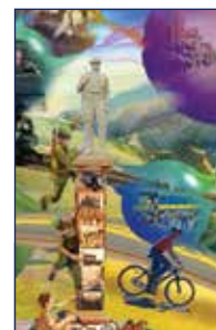
Detailed selection from the mural design