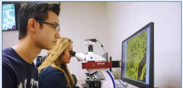
Science majors using the microscopy and digital imaging lab, located in Smith Hall.

Just a few years ago, we had a student who was partnering with a biochemistry professor to do research. He wanted to include digital imagery as part of his research. At the time, Pitt-Greensburg only had one set-up with those capabilities, and it was in almost constant use because of classes and labs. To facilitate the process, the professor made arrangements for the student to have access to a microscopy and digital imaging lab at a nearby campus, which allowed him to complete his research. Today, Pitt-Greensburg has a microscopy and digital imaging lab with six student stations and an instructor's station, made possible through a grant from the Eberly Foundation, along with additional funding from the Richard King Mellon Foundation and Pitt-Greensburg.