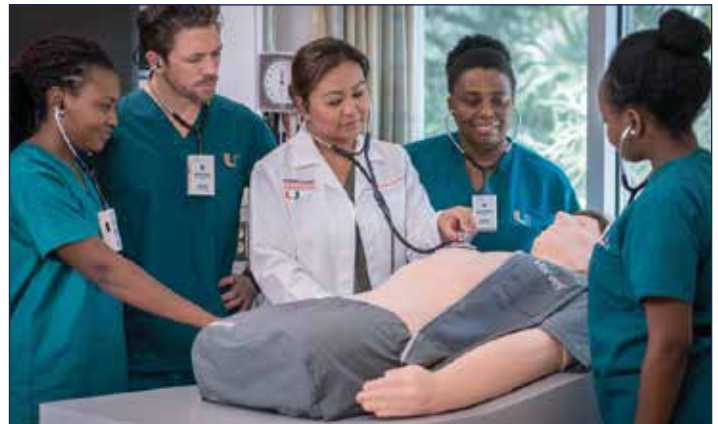
High-fidelity mannequins allow nursing students to see, hear, and feel actual physical sensations in the mannequin that mirror real-life medical scenarios. They provide a way for students to practice a variety of skills, as well as allowing instructors to simulate medical situations that students assess and then respond with appropriate treatments.

Our ultimate goal is to raise $250,000 for the Technology for the Future Challenge Fund, resulting in an endowment of $500,000 that includes the dollar-for-dollar matching funds. You can help us reach that mark, and in turn, help students to be better prepared for their careers and their futures. Visit www.greensburg.pitt.edu/tech-challenge for more information or to make your gift.