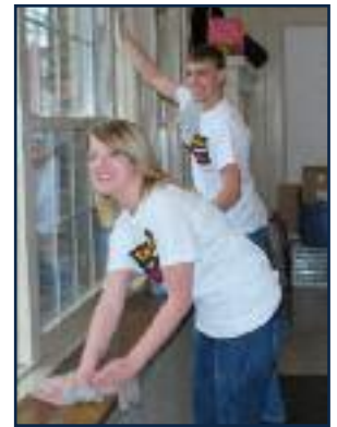
Into the Streets: More than 100 students annually participate in "Into the Streets." Students volunteer at more than 30 non-profit organizations over a three-day period.

Students may choose to do a "quarter-time" or "minimum-time" commitment. For the upcoming year, a student who completes 450 hours of service over one calendar year can earn an education award of $1,415; a student who completes 300 hours of service over one year can earn a $1,132 education award. The award can be used to pay for any legitimate educational expense at their current undergraduate institution or to pay for future educational expenses, as well as to re-pay student loans. ▲