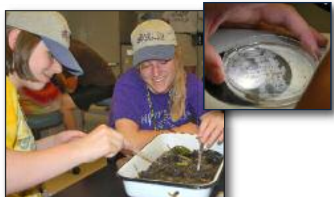
Students collected samples from two water sources and analyzed them for acidity levels and the number of living organisms.

Students from Greater Latrobe School District and Connellsville Area School District will participate in the program during the week of June 27 through July 2. Students from Derry Area school District will participate in SSME the week of July 11 through July 16. ▲