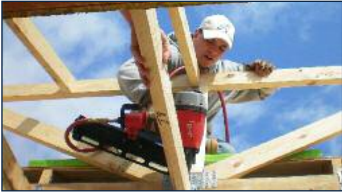
Habitat for Humanity: Eight Pitt-Greensburg students and two staff members traveled to Florida over Spring Break to build a house.

The University of Pittsburgh at Greensburg was one of 621 universities and colleges named to the President's Higher Education Community Service Honor Roll, the highest federal recognition a college or university can receive for its commitment to volunteering, service-learning, and civic engagement. Honorees were chosen based on selection factors that included the scope and innovation of service projects, percentage of student participation in service activities, incentives for service, and the extent to which the school offers academic service-learning courses.